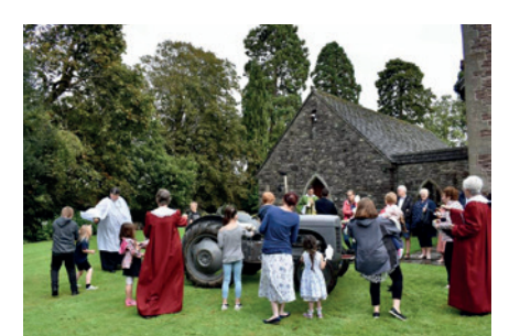
Celebrating harvest in style at St Mary's, Marshfield!

Everyone had great fun blessing the tractor and a few fleecey friends came along from Court Farm to support the day too!